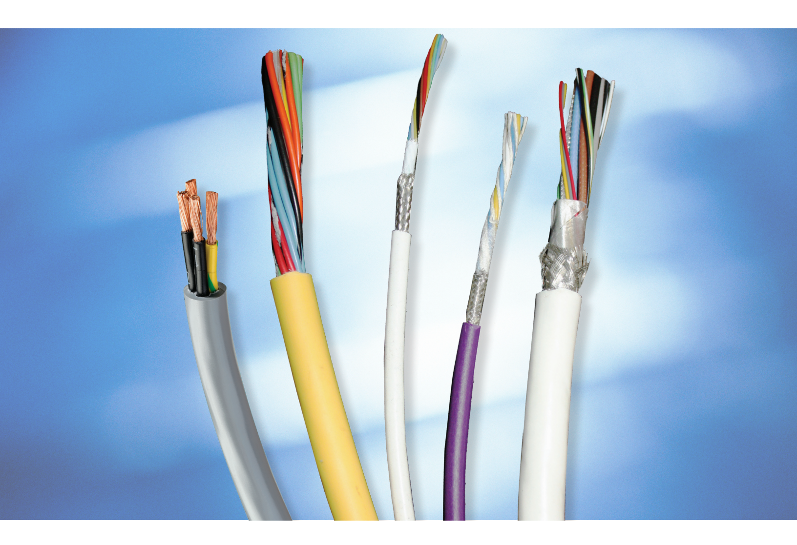
Engineering Your Success with Custom Cables