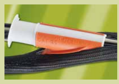
Wrappable Sleeving Tool This tool simplifies applying our GRP-130 and GRP-130NF sleeves.

Alpha heat guns are the perfect complement to FIT tubing, making it easy to apply the tubing quickly and efficiently.